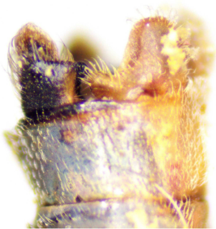
Figure 9. Oxyallagma dissidens : male appendix, lateral 97.1999.