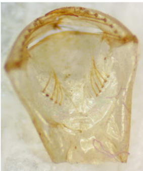
Figure 4. Prementum and labial palps of the exuvia of Oxyallagma dissidens 163.2.1999 in frontal view.