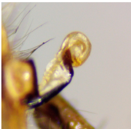
Figure 10. Oxyallagma dissidens : penis, lateral 97.1999.