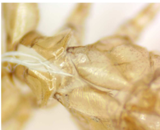
Figure 3. Habitus of the exuvia of Oxyallagma dissidens 166.2.1999, Pterothorax.