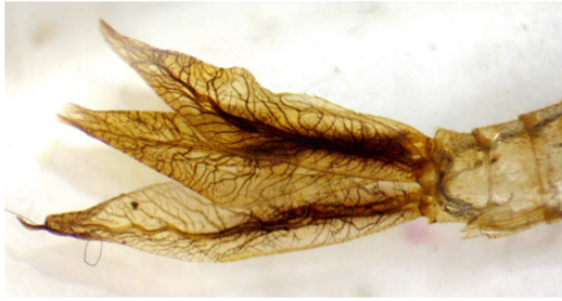
Figure 7. Abdominal gills of the exuvia of Oxyallagma dissidens 167.2.1999.