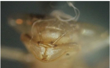
Figure 5. Labial palps of the exuvia of Oxyallagma dissidens 166.2.1999 in frontal view.