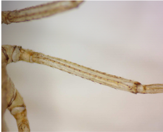
Figure 8. Hind Femur of the exuvia of Oxyallagma dissidens 97.1999.