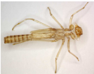
Figure 1. Habitus of the exuvia of Oxyallagma dissidens 166.2.1999 in dorsal view.