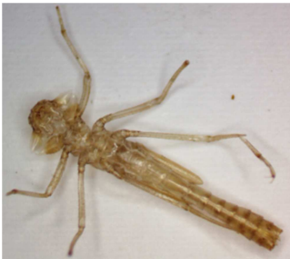
Figure 2. Habitus of the exuvia of Oxyallagma dissidens 166.2.1999 in ventral view.